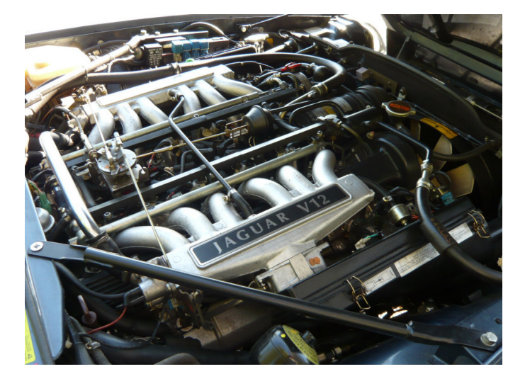
Figure 1: A look under the hood: Jaguar 5.3 liter V12 engine.

Cyrus A. Wilson* Orange Corp. Los Angeles, CA, USA cyrus@dev.null